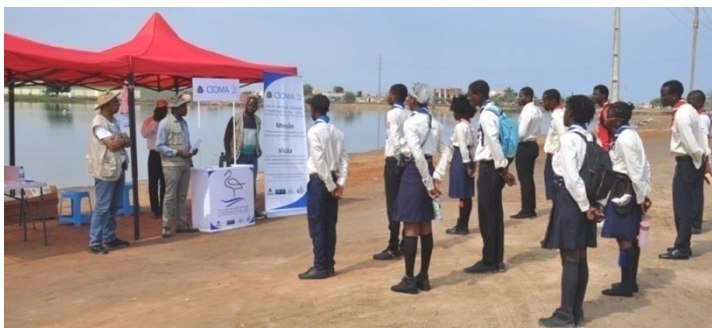
Image 1: Orientation briefing with Platoon A, moments before the campaign.

From a chronological point of view, the first activity that was carried out was the awareness campaign on the sustainable use of Lobito lagoons resources . This activity was planned with the aim of sensitizing 90 people involved in Lobito wetland site resources business; due to its complexity, this activity began to be prepared on October 23rd with the mobilization and training of volunteer sensitizers for 4 days.