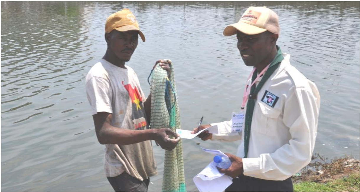
Image 3: A sensitizer raising awareness of a fisherman in Lobito lagoons.

Each of the 18 duos of sensitizers achieved the goal of sensitizing 6 individuals, totaling 108 people sensitized as seen in table 1. With these results, objective number 2, which provided for the sensitization of 90 people involved in Lobito wetland site resources business, was achieved with success.