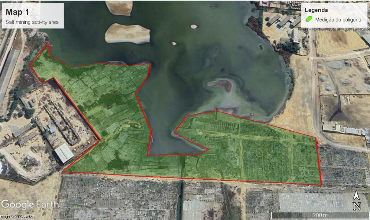
Map 1: Salt mining activity area in green colour background

an equal number of information leaflets (appendix 2), with the responsibility of approaching and raising awareness of 6 individuals involved in Lobito wetland site resources business.