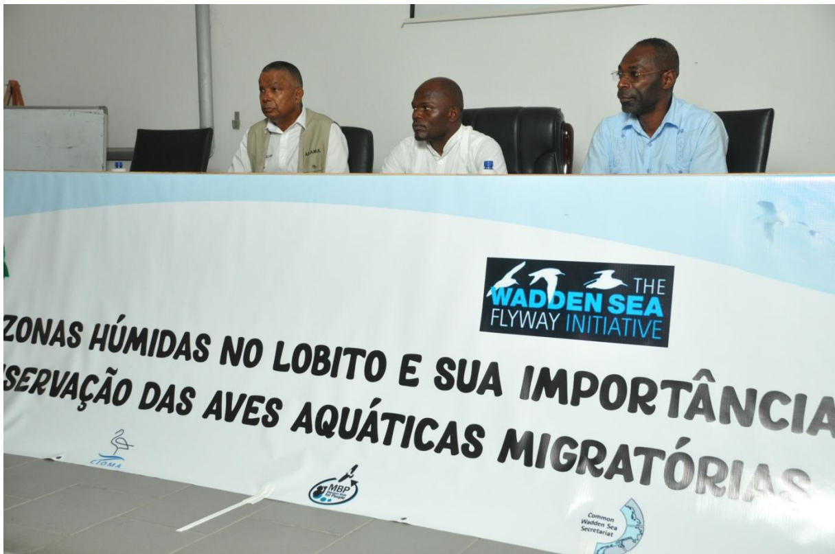
Image 9: ADAMA Secretary-general and two others panelists on the stage.

The Workshop took place in the Lobito municipal administration auditorium and was attended by 164 participants, including politicians, businesspeople, academics, similar non-governmental organizations, biology and chemistry students from the Lobito Technical Institute and other guests.