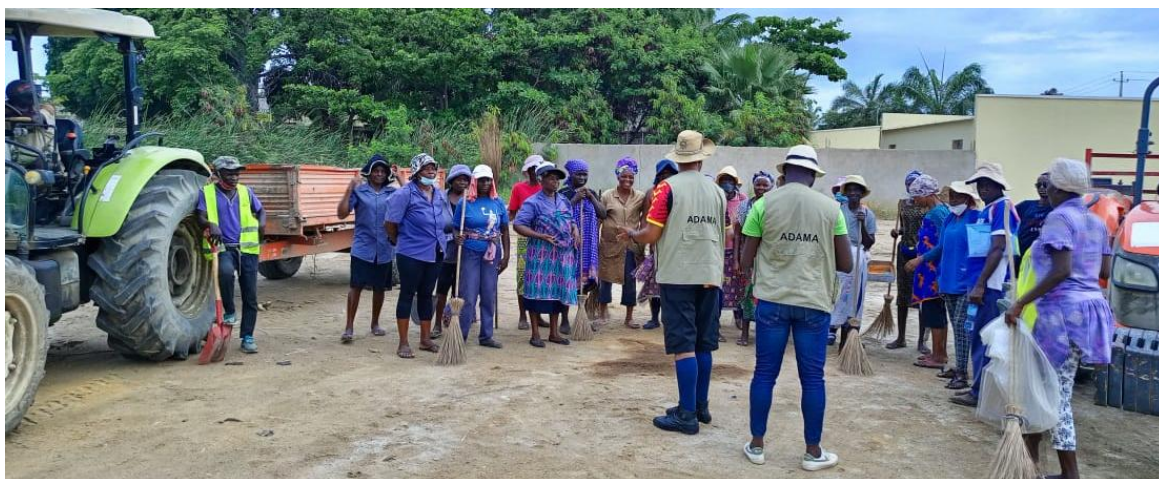
Image 7: ADAMA secretary-general talking to one of the hired team before the beginning of the work.

The campaign was made possible thanks to the hiring of an experienced team from Lobito's community services and young volunteers from the Universal Church in Angola, led by ADAMA volunteers. The community services team hired was made up of 40 women, each equipped with their own work tools and 3 men as drivers.