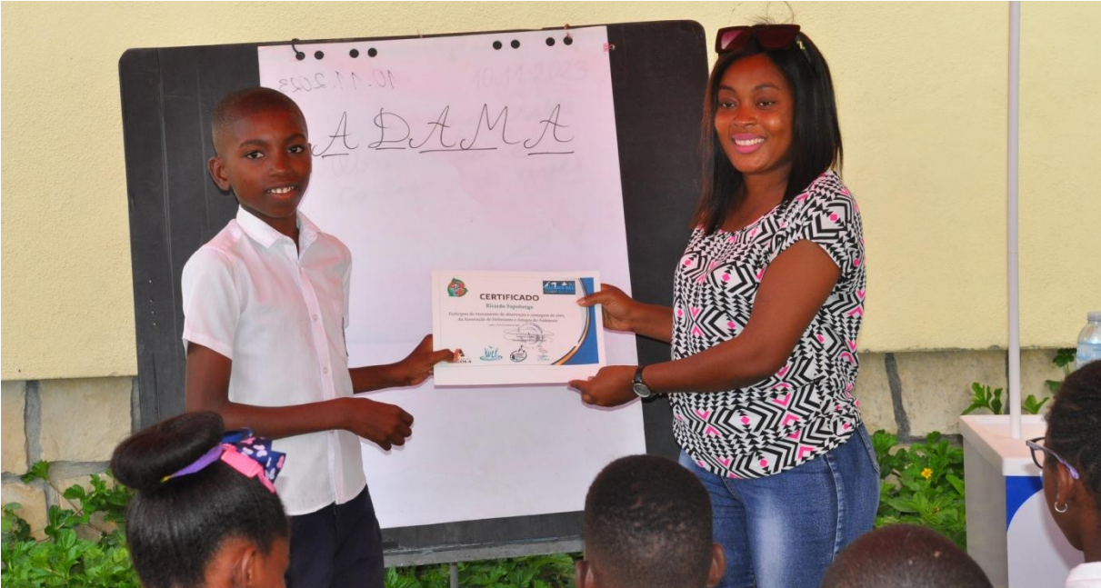
Image 6: A trainee receiving a participation certificate from a teacher.

In terms of content, the training had 2 components, one being theoretical and the other practical. The theoretical component dealt with 1) the importance of birding, 2) basic birding rules, 3) types of birdwatching and 4) bird counting techniques. In the practical component, all beneficiaries had the opportunity to practice birdwatching with binoculars and counting flocks of birds.