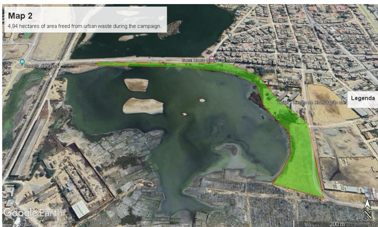
Map 2: Cleaned area during the campaign in green colour background

The campaign was made possible thanks to the hiring of an experienced team from Lobito's community services and young volunteers from the Universal Church in Angola, led by ADAMA volunteers. The community services team hired was made up of 40 women, each equipped with their own work tools and 3 men as drivers.