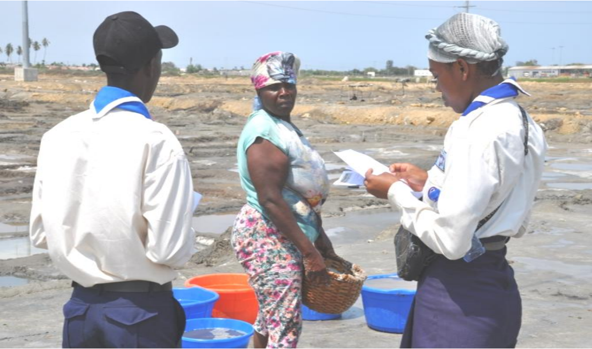
Image 2: A duo of sensitizers raising awareness of a salt miner on the Lobito lagoons perimeter.