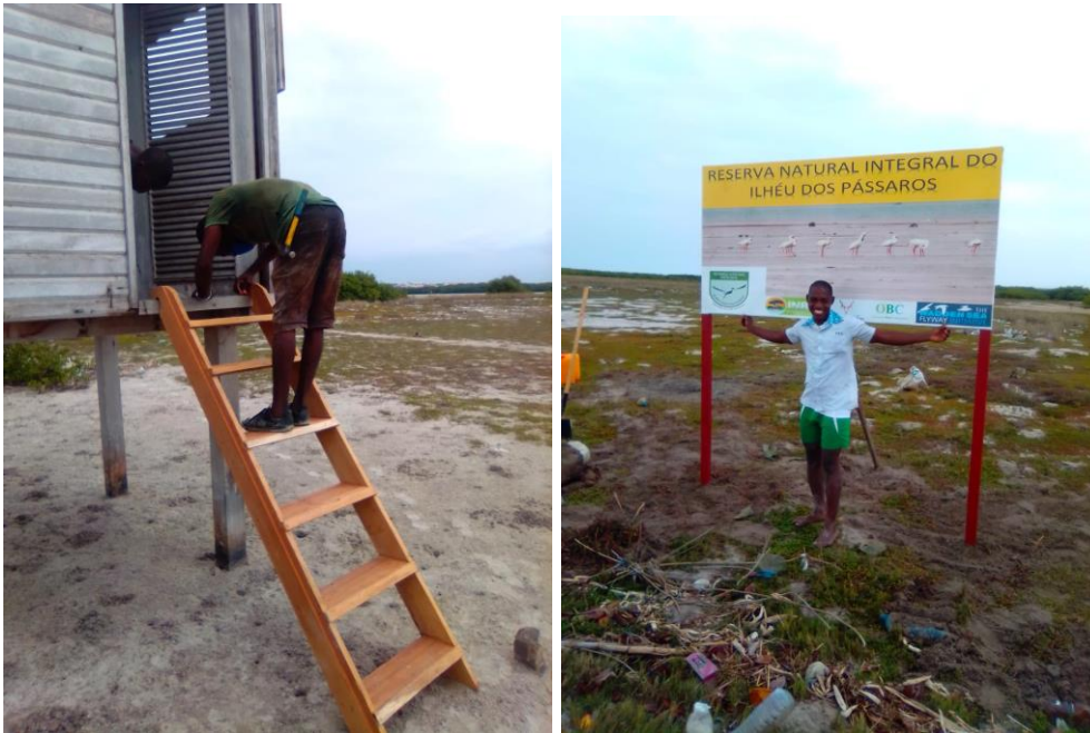
Figure 2- During the activities at Reserve

The rehabilitation of the Observatory and the placement of an information plaque on the status of Ilhéu dos Pássaros were essential to guarantee the work of environmental awareness, as well as the continuous monitoring of water birds in the Reserve. The objectives set out were successfully achieved, thus ensuring the use of the observatory for bird watching, as well as the integrity of the Reserve, taking into account that most of the individuals who invade it claim that they were unaware of the legal status of Integral Reserve.