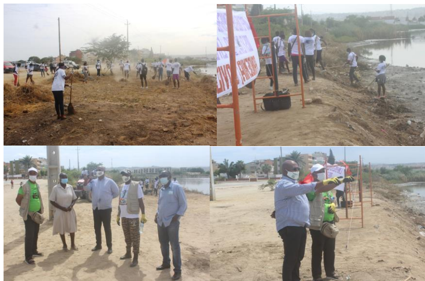
Figure 1- Participants during the activities

The project for environmental awareness and cleaning of waterbird habitats for the Protection of Flamingos and other waterbirds in the municipality of Lobito was successful as mentioned above. The organizers carried out an environmental awareness and awareness campaign for the communities that live around the main habitats. The process of environmental awareness and awareness also covered local authorities, schools around these important habitats. The activities that spanned two days, December 15-16, were attended by 127 individuals, including students, communities and representatives of the Lobito administration. It was possible to remove an enormous amount of waste, estimated at more than 1 ton of urban waste, essentially plastic.